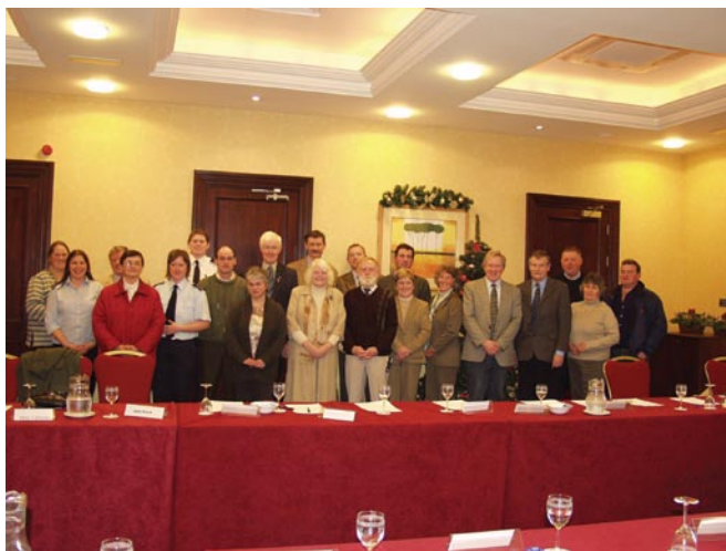
South West Region EWS Team