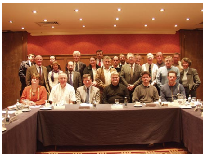
South East Region EWS Team