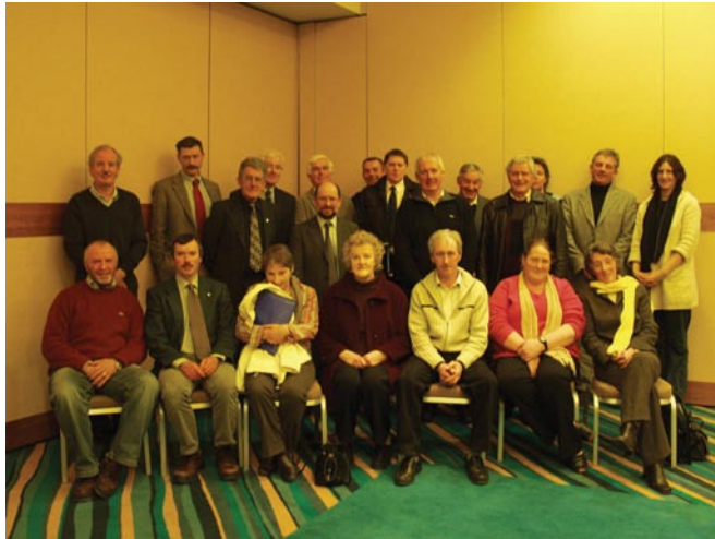
North West Region EWS Team