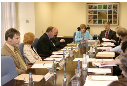
Minister with Council at meeting in June

In 2005 the Council held five meetings. The sub-groups met on fifteen occasions during the course of the year. Minister Mary Coughlan TD, addressed the June meeting and officially met members of Council. In her address she re-iterated the importance of the welfare of farm animals particularly in a country where agriculture continues to be such an important sector, and where animal welfare has become a high priority among the general public. She thanked Council for their valuable advice to herself and her predecessor.