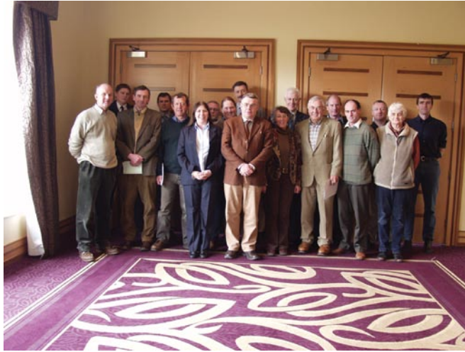
North East Region EWS Team